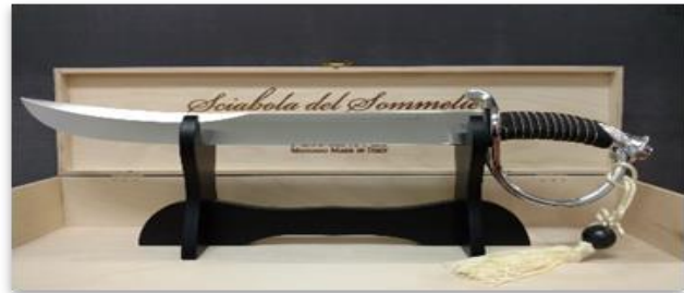
Farewell ceremony sabers available, engraved for free! See the Oreck ad for location and phone numbers

Ad Space Available Email the newsletter at Newsletter@AMVETSWAPOST1.ORG For information and rates