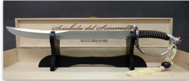
Farewell ceremony sabers available, engraved for free! See the Oreck ad for location and phone numbers

Ad Space Available Email the newsletter at Newsletter@AMVETSWAPOST1.ORG For information and rates